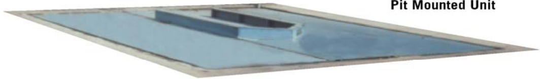
Pit Mounted Unit

TRUCK LEVELERS can perform duties from raising trucks for easier loading/unloading to elevating any trailer or truck bed to dock height. Can accommodate truck restraining devices.