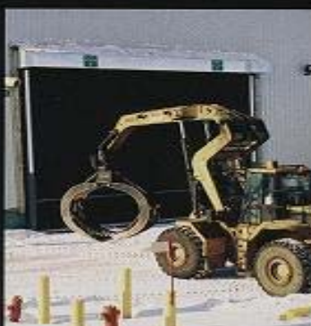
TNR® RUBBER ROLL-UP DOORS YOU CAN RELY ON WHEN THE MACHINES ARE BIG.