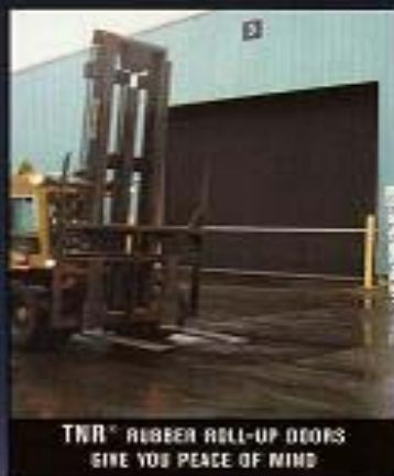
TNR® RUBBER ROLL-UP DOORS GIVE YOU PEACE OF MIND